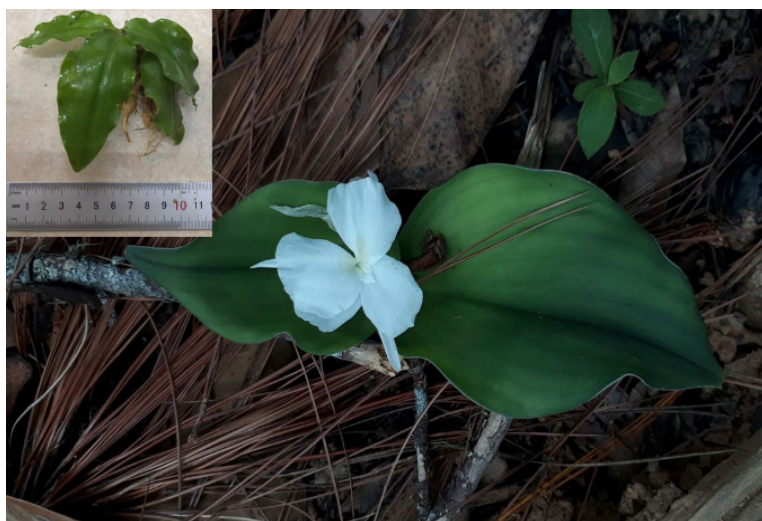
Figure 1. Kaempferia champasakensis Picheans. & Koonterm

stomach pain. To date, there has been no further research on phytochemical and pharmacological investigations on this species. Kaempferia plants in particular and Zingiberaceae plants in general are well-known for their signature essential oil, particularly K. galanga , K. angustifolia , K. marginata , which have been widely used in different pharmaceutical and food industries. The documented principal components were reported to contain phenylpropanoids and trans -ethyl cinnamate with the content varying from 16 to 35% of total essential oil components 3,5-7 . The volatile oil prepared from K. galanga were also shown to exhibit potential anti-microbial 8 , larvicidal 9 , and nematocidal 10 activities against various pathogenic microorganisms. The chemical constituents and biological activities of essential oils from some other Kaempferia species grown in Vietnam and other countries have been reported. For illustration, \alpha -pinene (3.22%), camphene (23.63%), camphor (4.42%), borneol (4.80%), isborneol (5.77%), ishwarane (3.29%) and 1,8-cineole (2.89%) were the major components of the essential oils of the rhizome of K. daklakensis from Daklak Province, Viet Nam 11 . The chemical constituents of the rhizomes of K. galanga from Guangxi province, China was reported to consist of iso -amyl p -methoxycinnamate (42.8-27.5%), n -pentadecane (21.6-32.8%), ethyl cinnamate (16.1-17.1%), cyperene (2.0-3.4%) and p -methoxystyrene (1.6-2.6%) 12 , while the