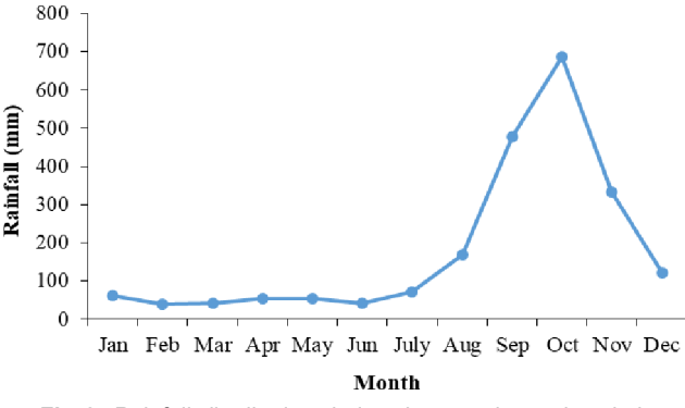
Fig 2: Rainfall distribution during the experimental period.