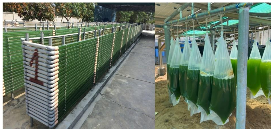
Figure 2: The photo bioreactor system (left hand) and plastic bags (right hand)