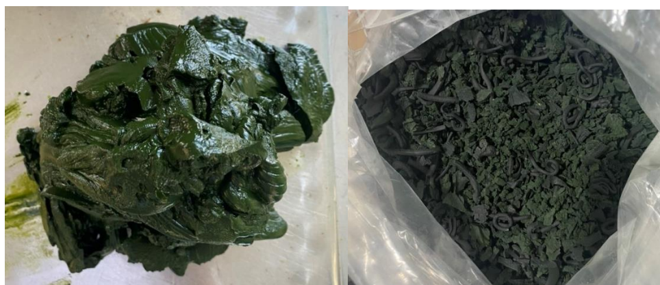
Figure 4: Fresh concentrated algae (left) and dried algae (right)

Thus, the model made a total products of 57.6 kg of dried algae N.oculata powder.