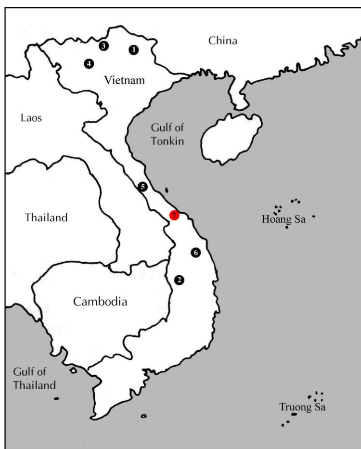
Fig.3. Distribution of Dopasia gracilis in Vietnam

Elsewhere, this species is known from India, Nepal, China, Myanmar, Laos and Thailand [4,10,11].