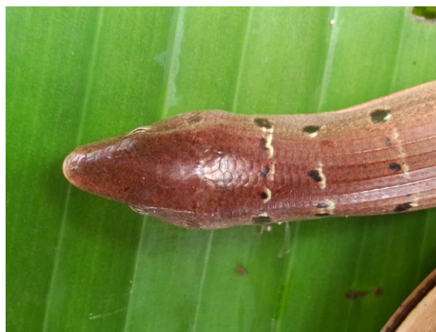
Fig.2. Dopasia gracilis (BM2014-02) from Bach Ma NP, Thua Thien-Hue province.