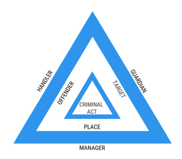
Fig. 1 The crime triangle (adapted from Eck 2003)