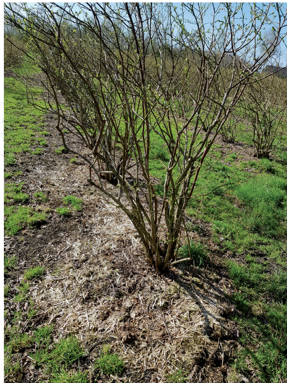
Figure 1. High blueberry bush growing in a place flooded with water.

When choosing plantation locations, it is worth remembering that sandy soils are more suitable than heavy soils. This is confirmed in studies conducted by Cho et al. which have shown that clay soils are not useful for the cultivation of highbush blueberry in the Damyang Province, Korea [11]. It is important that the substrate has a