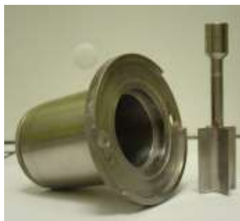
Fig-1: Vane-cylinder used for the rheology test

To measure rheological properties of mortars, flow tests were performed using a high-accuracy rheometer (figure 1), a commercial rheometer called AR2000ex of TA instrument series.