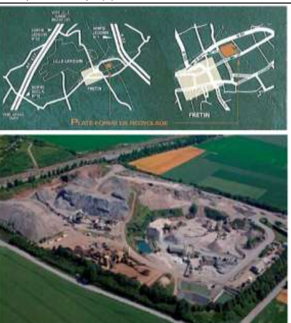
Fig-1: Plate-forme of recyclage Fretin

To calibrate the materials, a pre-treatment of this bottom ash like sifting, removal of ferrous and not - ferrous elements, was carried out on site. After, this bottom ash was matured for 3 months (Figure 2). A