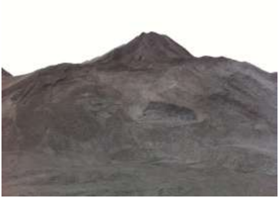
Fig-2: Bottom ash

range of particle sizes from 0 to 20 mm was chosen to approach the size range of natural aggregates which is usually used in the road field.